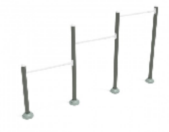
Triple Station Inclined Chin-Up Bars